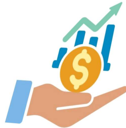
Business Benefits Chart Colored Icon